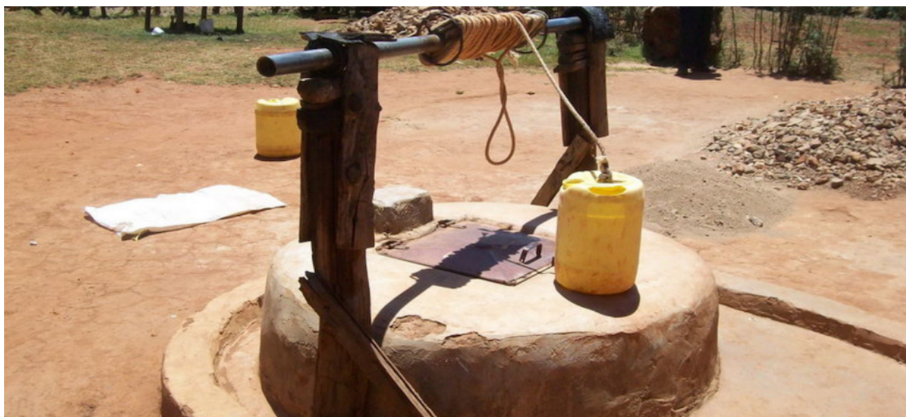
A typical shallow well

This research under the AfriWatSan project assessed groundwater and sanitation challenges based on field surveys, sampling, analyses, and interviews as well as reviews of the literature and historical borehole data in Kisumu, Kenya. Previous studies in the area have shown that the number of shallow wells, buildings, unimproved pit latrines and sanitary risks have increased tremendously between 1999 and 2019. This study confirmed that the main water and sanitation challenges in Kisumu are: (1) inadequate, poor and deteriorating water quality, (2) poor waste disposal management systems, and (3) poor sanitation services. There is a need for the introduction of new and sustainable groundwater approaches supported by science and decision-making processes that involve all stakeholders. Current deficiencies in the provision of adequate water and dignified sanitation to the poor in Kisumu can be remedied through improved knowledge on shallow aquifer dynamics and innovative research. It was noted that apart from the donor agencies and multi-national NGOs, private investors are unwilling to invest in water projects in Kisumu due, in part, to government legislation that constrains the cost that may be levied on water.