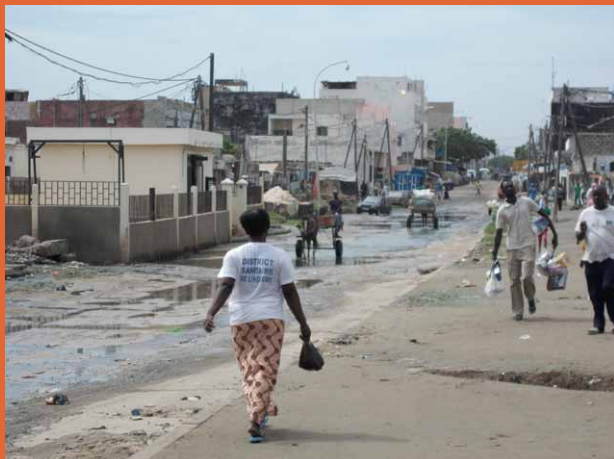
Contaminated urban drainage, Dakar