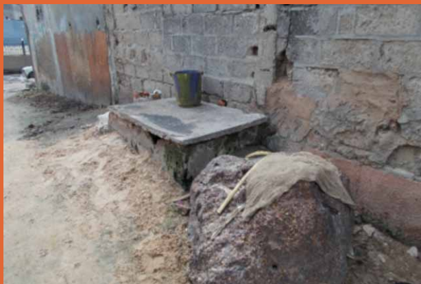
Domestic septic tank in Dakar, Senegal

The ability of the subsurface to supply safe water and adequately contain faecal waste has not been rigorously assessed. There remains an absence of scientific evidence, policies and practices to sustain the quality and quantity of groundwater used for urban water supplies in urban Africa, and to reconcile this with the continued use of the subsurface for low-cost sanitation.