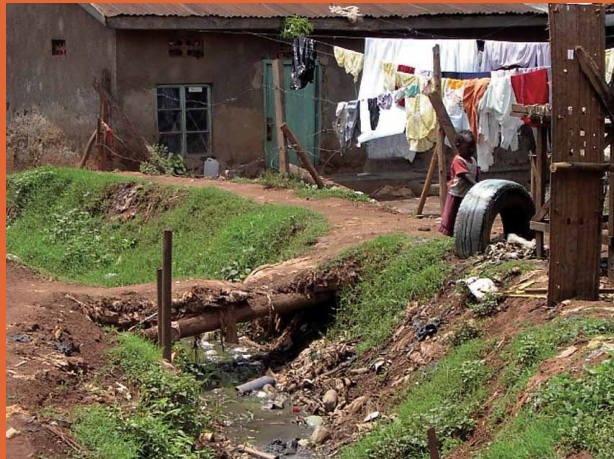
Poorly maintained drain channel in Kampala, Uganda