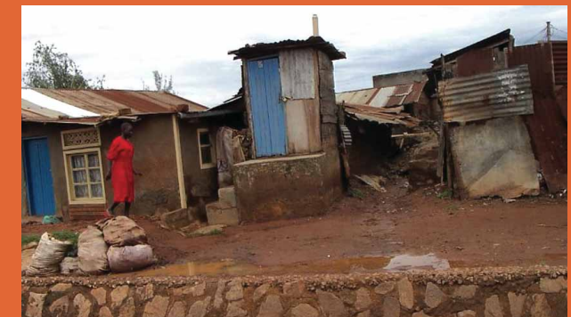
Elevated pit latrine in Kampala, Uganda