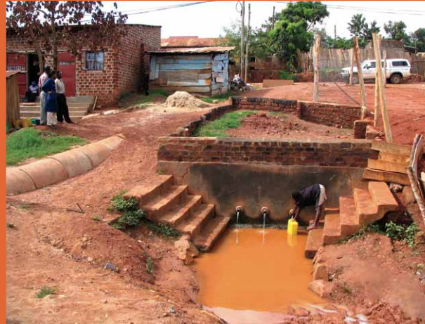
Protected spring in Kampala, Uganda

AfriWatSan is a 5-year capacity-strengthening (2015-2020) and cross-disciplinary research collaboration tackling the fundamental challenge of sustaining and expanding access to low-cost water supply and sanitation systems that conjunctively use the subsurface as both a safe source of water and a repository of faecal wastes. It is one of the first multi-scale (town – city – mega-city) analyses of urban groundwater and sanitation and their links to human health in Sub-Saharan Africa.