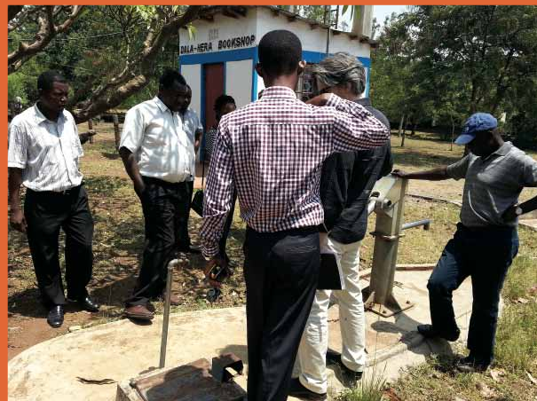
Cross-disciplinary research team in Kisumu, Kenya

AfriWatSan addresses identified skills gaps and explicitly links research outcomes to policy outcomes through the engagement of stakeholders that include government ministries, basin management organisations and private-sector water suppliers.