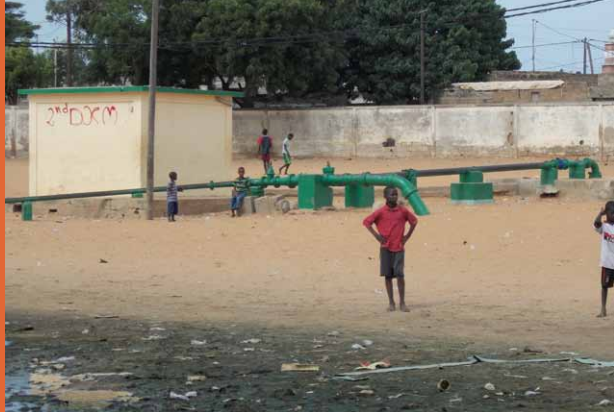
Groundwater pumping station in Dakar, Senegal

Towns and cities in Sub-Saharan Africa are growing at a faster rate than any other region in the world. Efforts to improve access to safe water in rapidly urbanising areas commonly target groundwater on account of its resilience to climate variability and generally safe quality that avoids the high costs of treatment associated with water drawn from rivers and lakes. In addition, efforts to expand access to sanitation primarily focus on low-cost, on-site technologies such as pit latrines and septic tanks that rely upon the subsurface to contain faecal wastes.